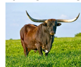
TX W Lucky Lady