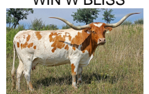
WIN W BLISS