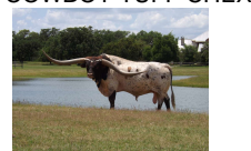
COWBOY TUFF CHEX