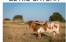
BL RIO CATCHIT