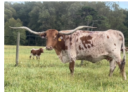
HORSESHOE J CADENCE