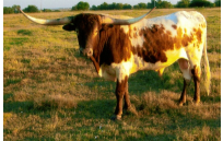
WATSON 258 E-MAIL