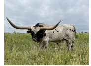
BL RIO CATCHIT