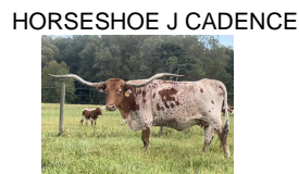
HORSESHOE J CADENCE