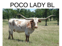
POCO LADY BL