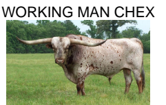
WORKING MAN CHEX