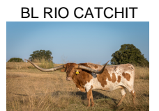
BL RIO CATCHIT