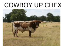
COWBOY UP CHEX