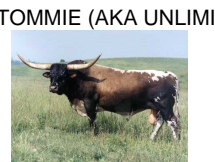
VJ TOMMIE (AKA UNLIMITED)