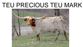
TEU PRECIOUS TEU MARK