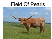
Field Of Pearls