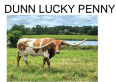
DUNN LUCKY PENNY