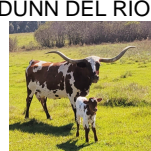
DUNN DEL RIO READY