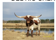
DEL RIO CHEX