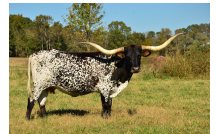
HORSESHOE J INTERJECT