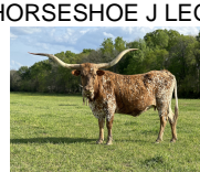
HORSESHOE J LEGIBLE