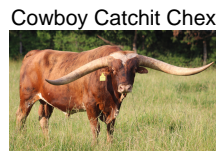
Cowboy Catchit Chex