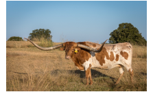
BL RIO CATCHIT