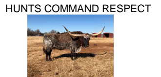
HUNTS COMMAND RESPECT