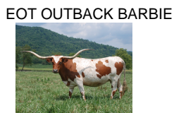
EOT OUTBACK BARBIE