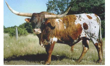
Miss Redmac 853