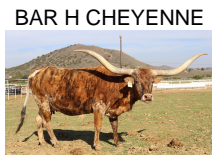
BAR H CHEYENNE