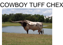
COWBOY TUFF CHEX