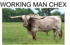
WORKING MAN CHEX