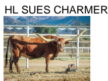
HL SUES CHARMER