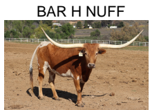
BAR H NUFF