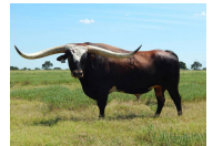
HR SLAM'S ROSE