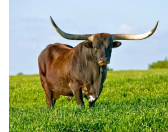
TX W Lucky Lady