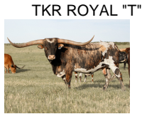
TKR ROYAL "T"