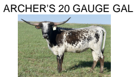
ARCHER'S 20 GAUGE GAL