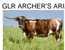
GLR ARCHER'S ARIA