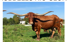
HUBBELLS RIO GLORY