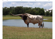
COWBOY TUFF CHEX