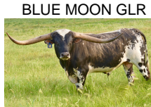
BLUE MOON GLR