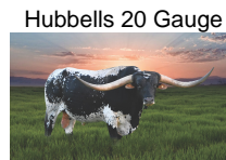
Hubbells 20 Gauge