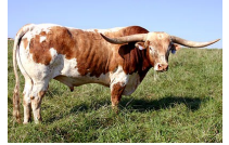
MY MY MY