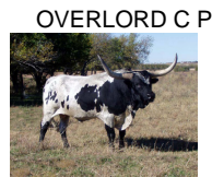
OVERLORD C P