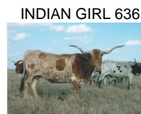
INDIAN GIRL 636