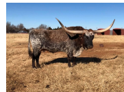
HUNTS COMMAND RESPECT