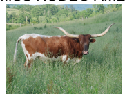
MISS RODEO AMERICA