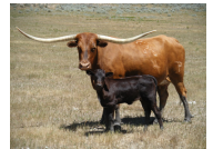
SHEZA HOT CHICK