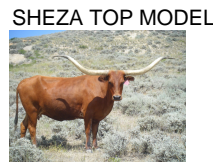
SHEZA TOP MODEL