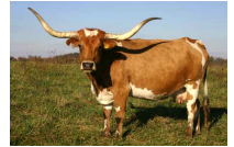
MY MY MY