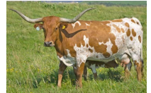
FIELD OF ROSES