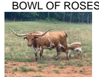
BOWL OF ROSES