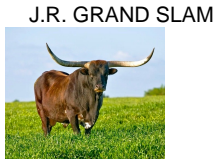
J.R. GRAND SLAM