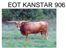
EOT KANSTAR 906