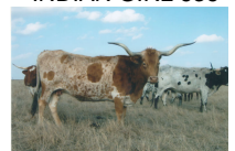
INDIAN GIRL 636