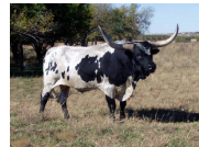
OVERLORD C P