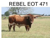
REBEL EOT 471