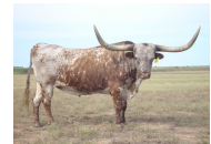
ACE'S CREOLE ROAN