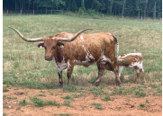
BOWL OF ROSES