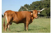
LAMB'S POWER PLAY