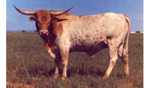
TEXAS RANGER JP