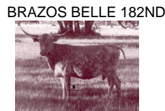
BRAZOS BELLE 182ND