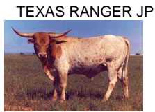
TEXAS RANGER JP