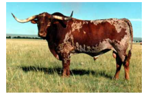
OVERWHELMER SHE'S A SUPER LADY