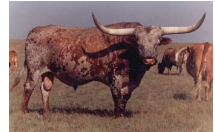
G&L TRUE OBSESSION