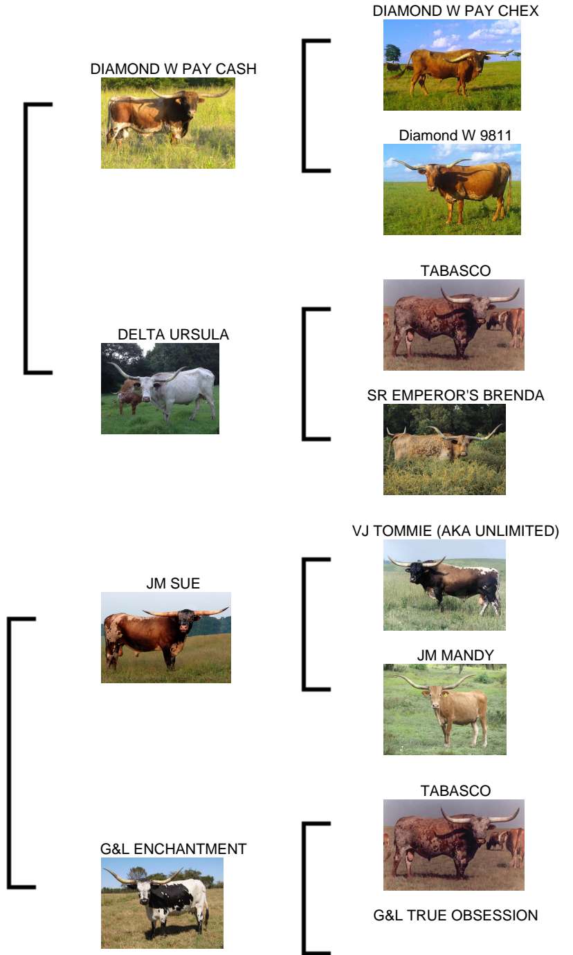
DIAMOND W PAY CASH