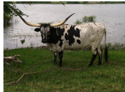
G&L ENCHANTED SUE