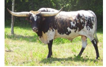
Horseshoe J Charm