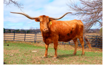
BL Coach's Desperado