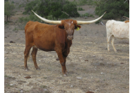
Allens Sittin Sunny 407