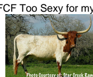
FCF Too Sexy for my Sox