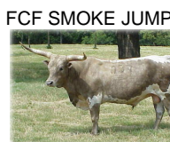
FCF SMOKE JUMPER