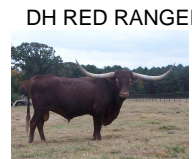
DH RED RANGER