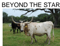
BEYOND THE STARS