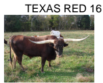
TEXAS RED 16