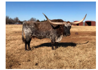
HUNTS COMMAND RESPECT