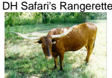
DH Safari's Rangerette