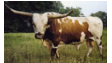
DON JUAN OF CHRISTINE