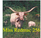
MISS REDMAC 256