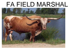
FA FIELD MARSHAL