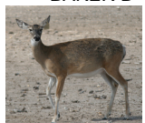
BAKER D 4