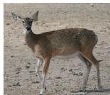
LAYLA B 472