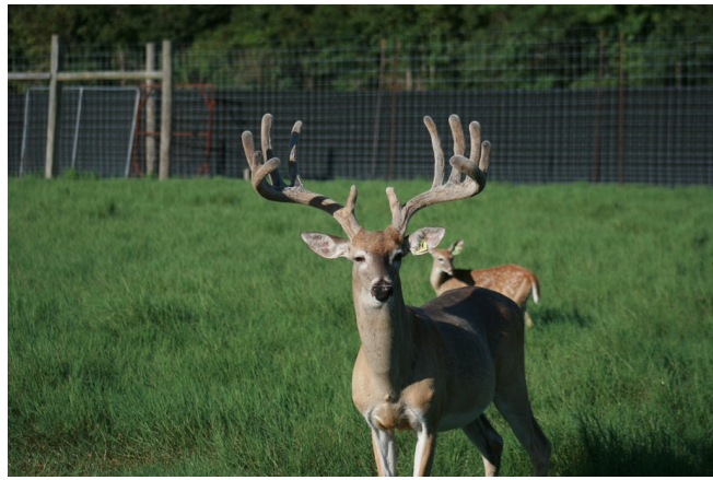
SE TX CHIEF

Date of Birth: 01/01/2006 Registration 2: 30290