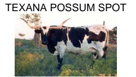
TEXANA POSSUM SPOT