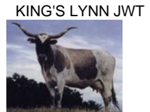
KING'S LYNN JWT