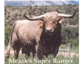
MEASLES' SUPER RANGER