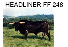
HEADLINER FF 248