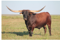
Zeus EOT 9E5