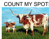
COUNT MY SPOTS