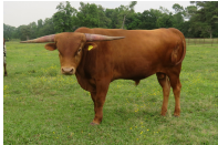
M ARROW DRAGNET