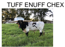
TUFF ENUFF CHEX