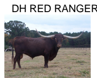
DH RED RANGER