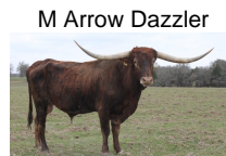
M Arrow Dazzler