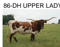
86-DH UPPER LADY