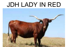
JDH LADY IN RED