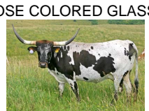
ROSE COLORED GLASSES