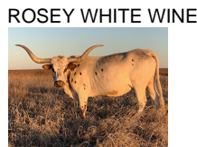
ROSEY WHITE WINE