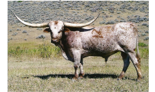
WARPAINT SHADOWS CHOICE