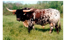
Spend A Shadow